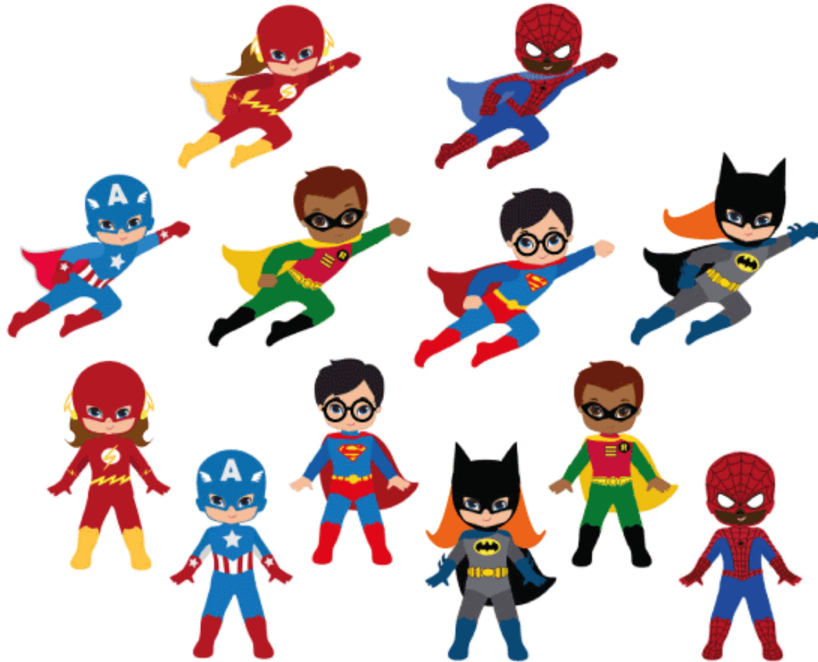
Bottom half, left to right: The Flash, Captain America, Superman, Cat Girl, Robin, Spider Man